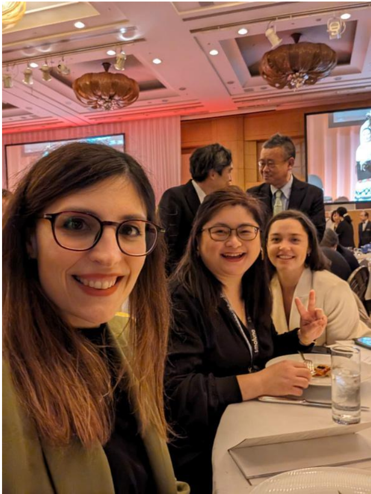
...while the ENTOG trainees absorb the sheer scale of the dinner and its delicious Japanese fine cuisine with a French twist and engage with the Japanese delegates at our table..!